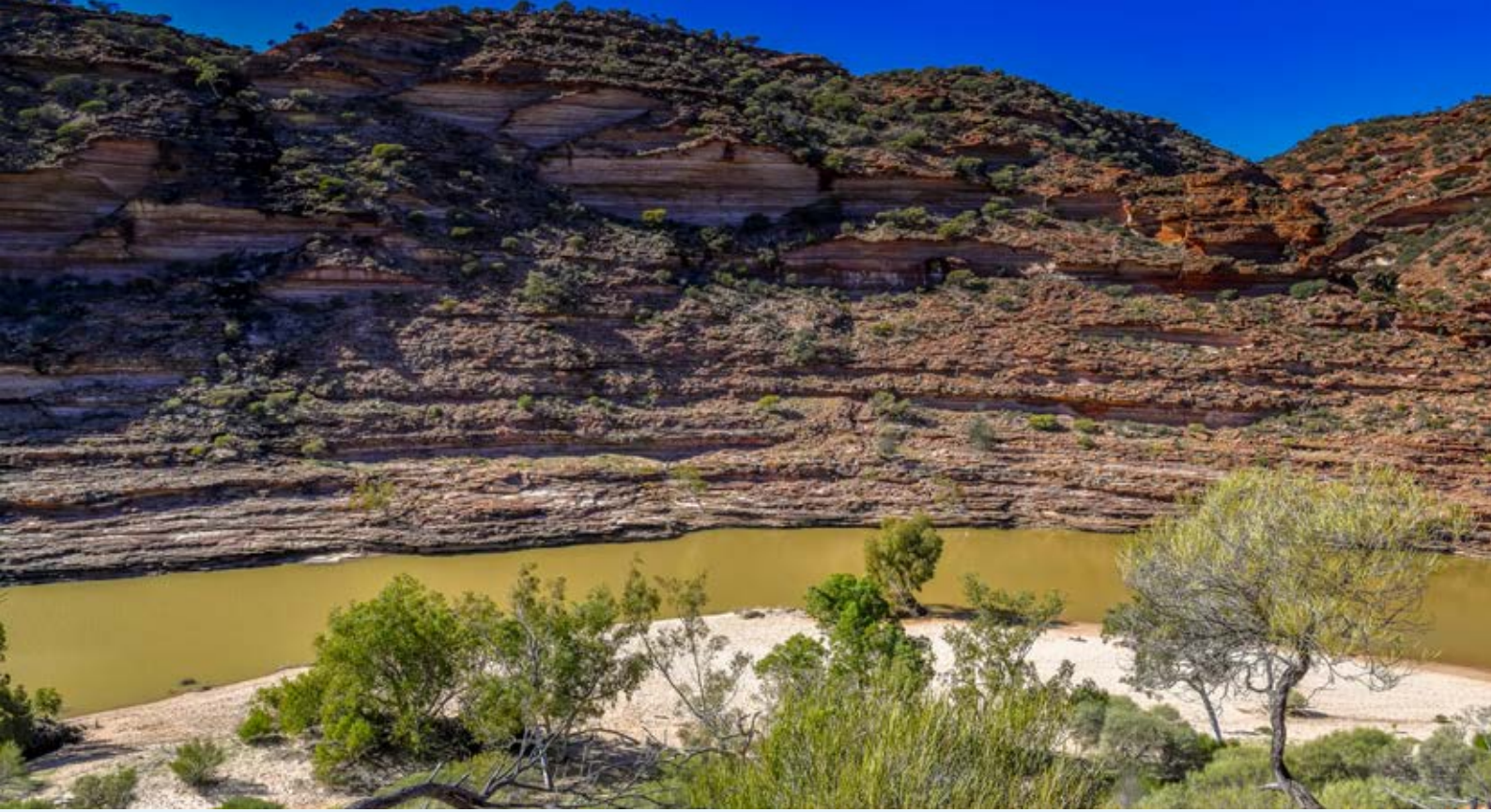
Murchison Gorge, Nanda Country.