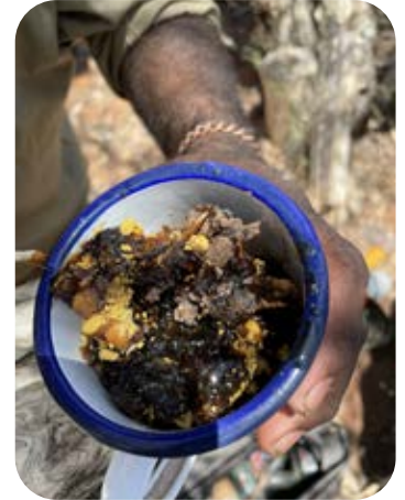
A mug of collected honeycomb and honey.

The challenge was clear: traditionally, harvesting native bee hives for walajah (honey) destroys the hive. Rangers wanted a way to harvest the honey while preserving the bees by relocating the brood and queen after harvesting.