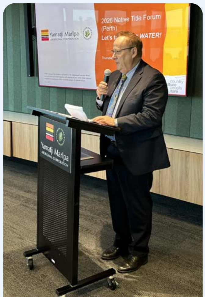
WA Minister for Aboriginal Affairs, Water and Climate Resilience Hon Don Punch MLA, presenting at the Native Title Forum in Perth.

Despite this, the Minister also made it clear the State Government will not be proposing any major amendments to related legislation in the short-term, but that engagement through water planning is a means to improve the way First Nations cultural knowledge is incorporated into processes. Many attendees voiced their concerns in response, arguing the need for urgent and meaningful changes, rather than a gradual approach, to be of any genuine effect.