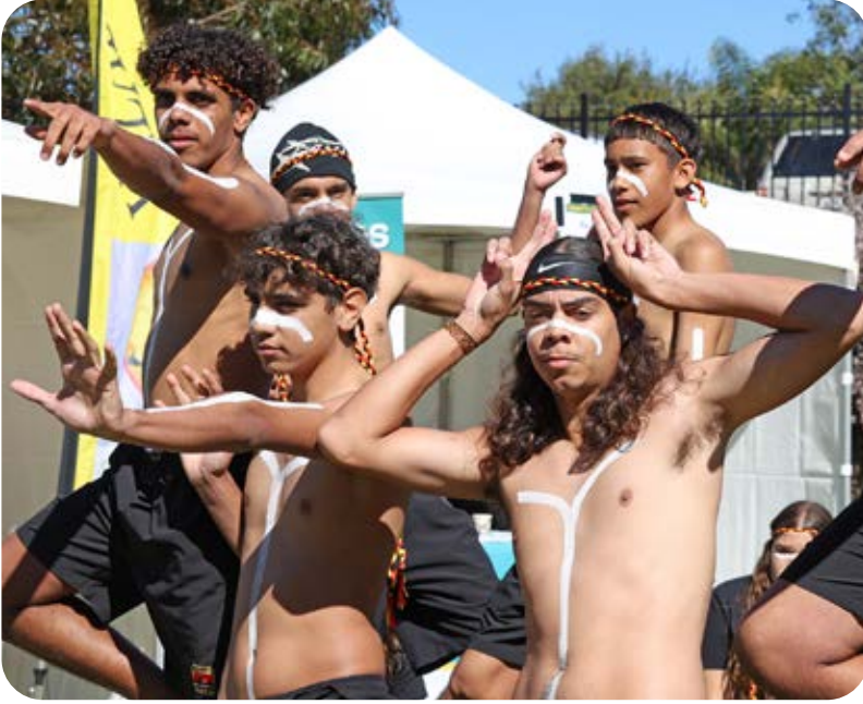
Wirri Bundara Dance Group from Geraldton Senior High School perform at the 2025 Yamatji On-Country.