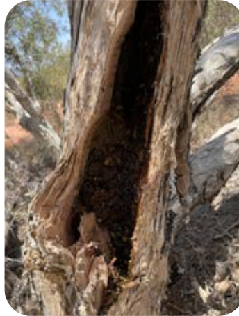
A bee hive taken from a split Melalucea tree.