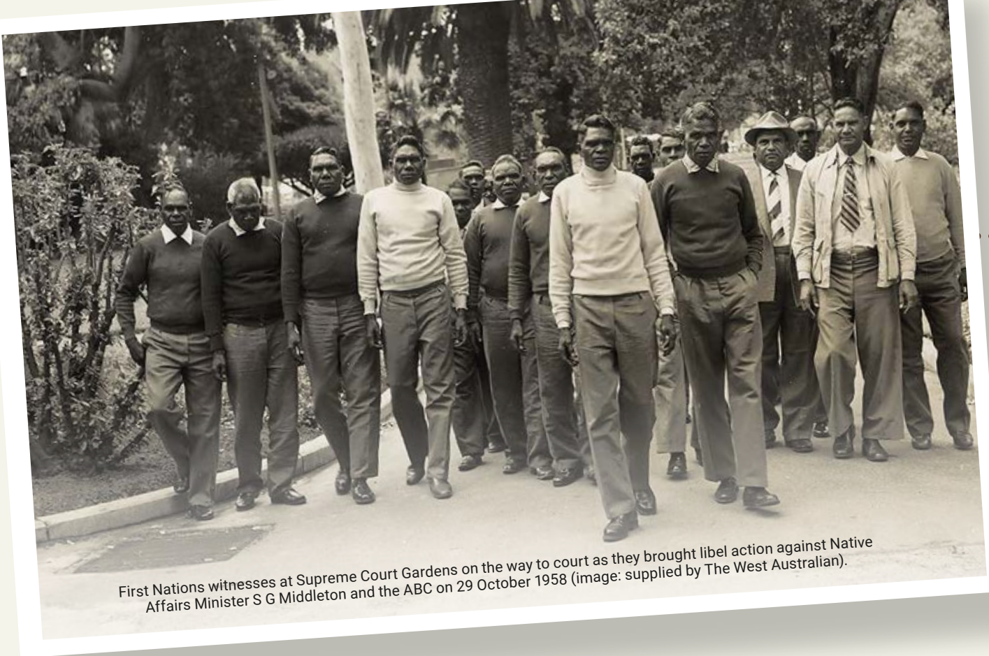
First Nations witnesses at Supreme Court Gardens on the way to court as they brought libel action against Native Affairs Minister S G Middleton and the ABC on 29 October 1958.

Whilst the strikes were supported by unions and unionists from across the nation, many strikers were left to fend for themselves. Having walked off the stations completely, many strikers were living in strike camps they had set up throughout the Pilbara.