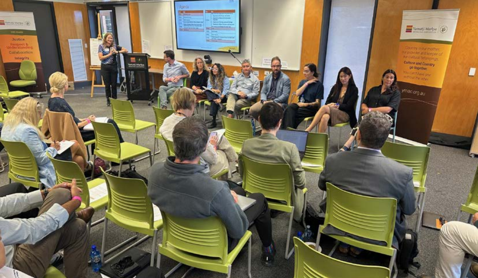
Panel of presenters at the Native Title Forum in Geraldton (image: Tash Gillespie).

Other key concerns arising throughout the forums included: