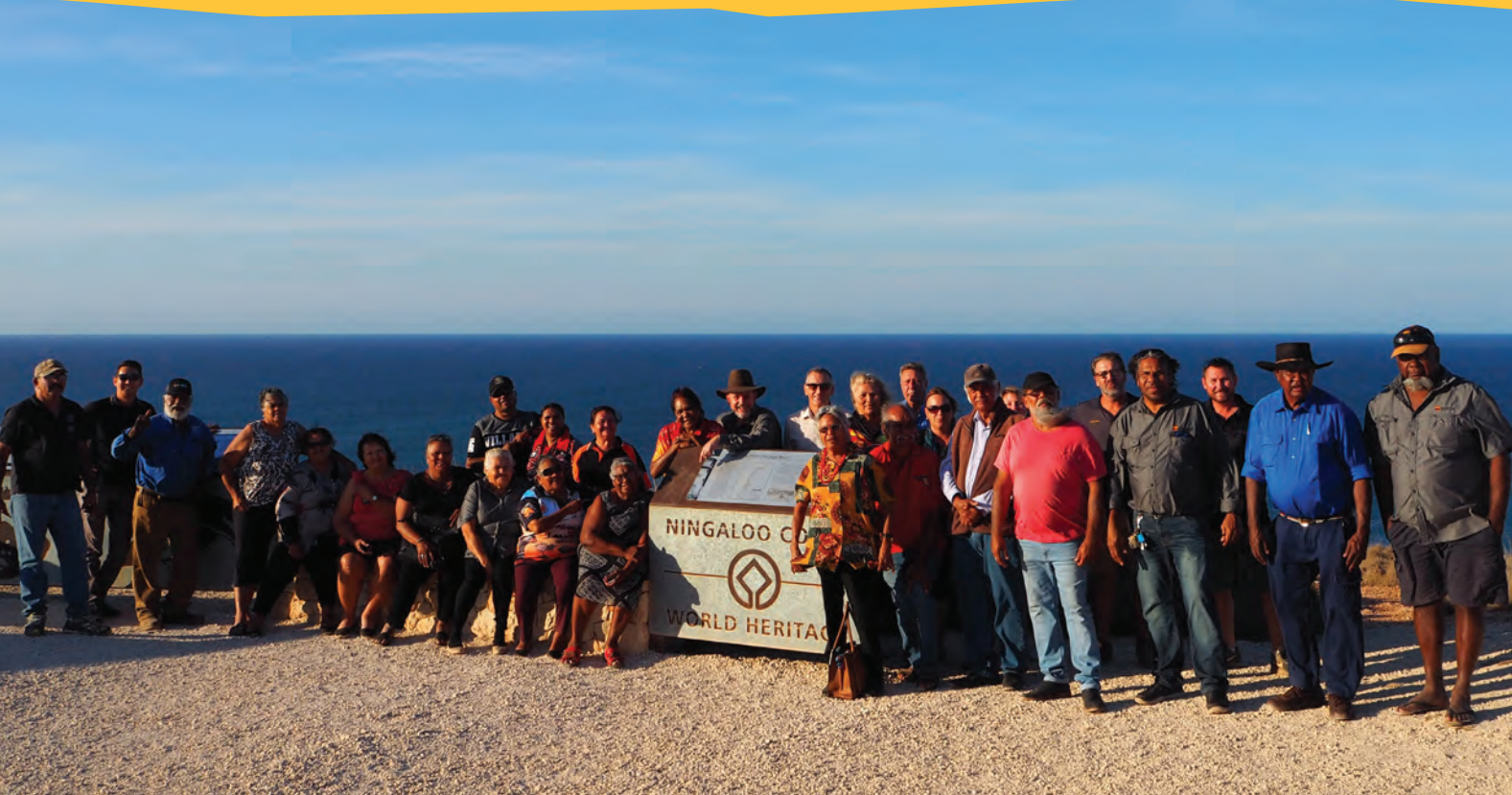
YMAC Directors, Committee and staff with Department of Biodiversity, Conservation and Attractions staff at Exmouth Lighthouse overlooking Ningaloo Marine Park.