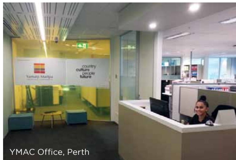
YMAC Office, Perth

Thank you to everyone who has assisted with the transition!