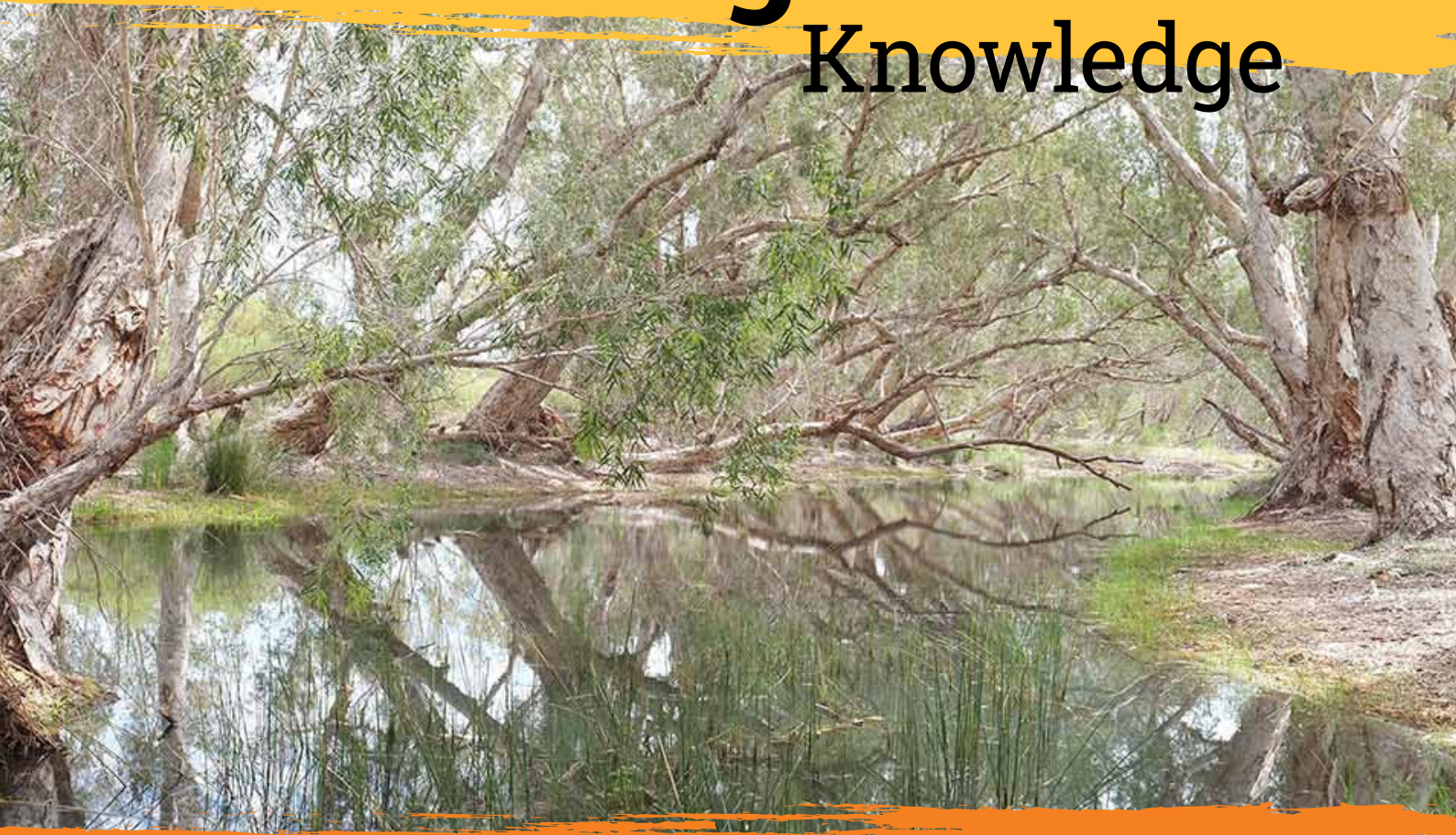
ABOVE: Waterhole at Jungarri , in Kuruma Country outside Pannawonica LEFT: Dale's Gorge in Banjima Country, Pilbara

Knowledge Partnerships has been working with the Kuruma and Marthudunera (K&M) Peoples on a Traditional Ecological Knowledge (TEK) project. Funding for the TEK is provided by Lotterywest and with support from the Kuruma Marthudunera Aboriginal Corporation (KMAC).