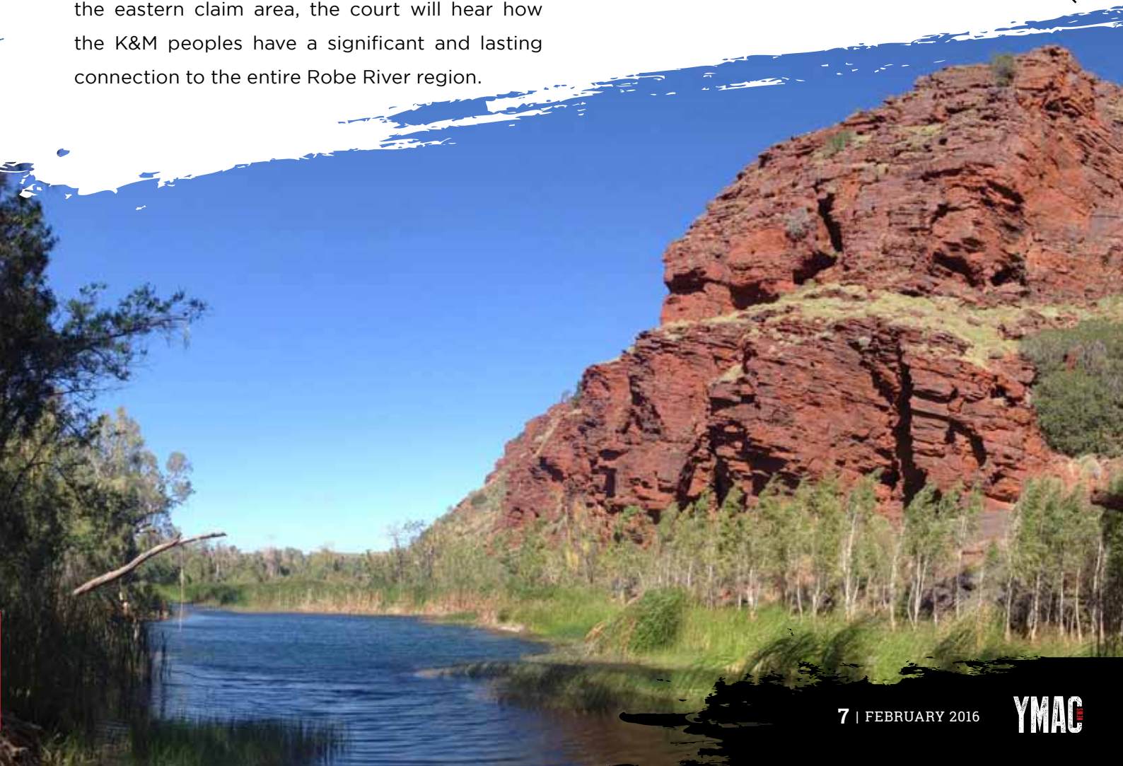
BELOW: Deepdale, a waterhole on the Robe River