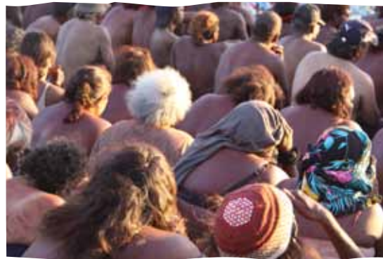
Pilbara Law Business

During a mourning period some people will not eat certain foods like red meat, kangaroo meat or fish. Meeting participants might have certain medical conditions such as diabetes that affect their diet. People may refuse food for these reasons, so it's good to ask beforehand what people can and can't eat. Be sure to have a variety of food available.