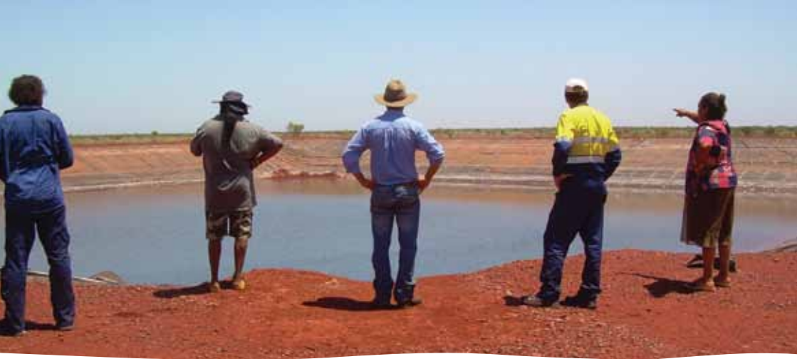
Kurama Marthudunera Country