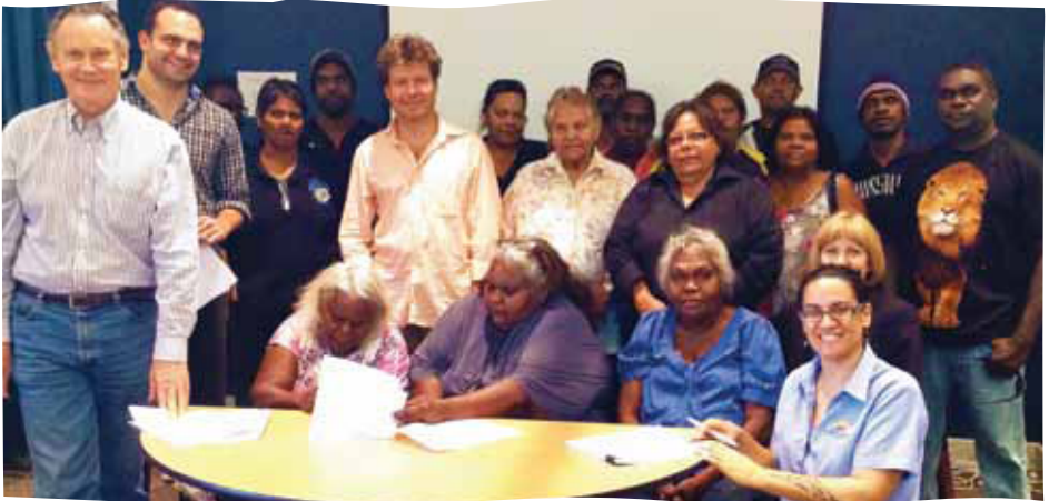
Ngarlawangga Agreement Signing

making time in your schedule. Rushing decisions or putting pressure on people can result in uncertainty and will waste time in the long run.