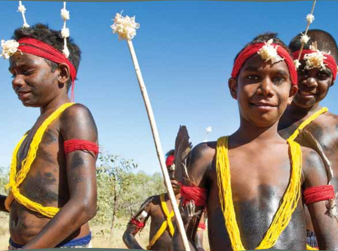
Nyangumarta Boys on Country

for People working with Aboriginal Communities in the Pilbara and Yamatji Regions