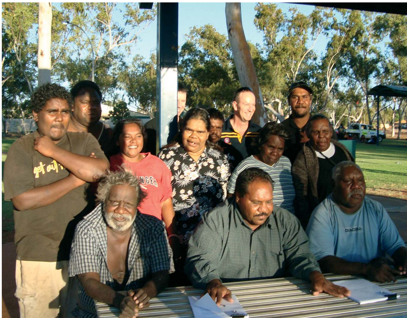
Above: Kariyarra members and Atlas Iron representatives at the agreement signing.