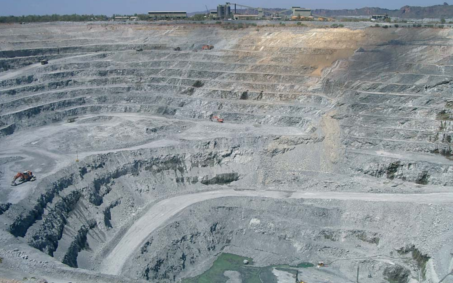
Above: Ranger Uranium Mine, Kakadu National Park, Northern Territory.