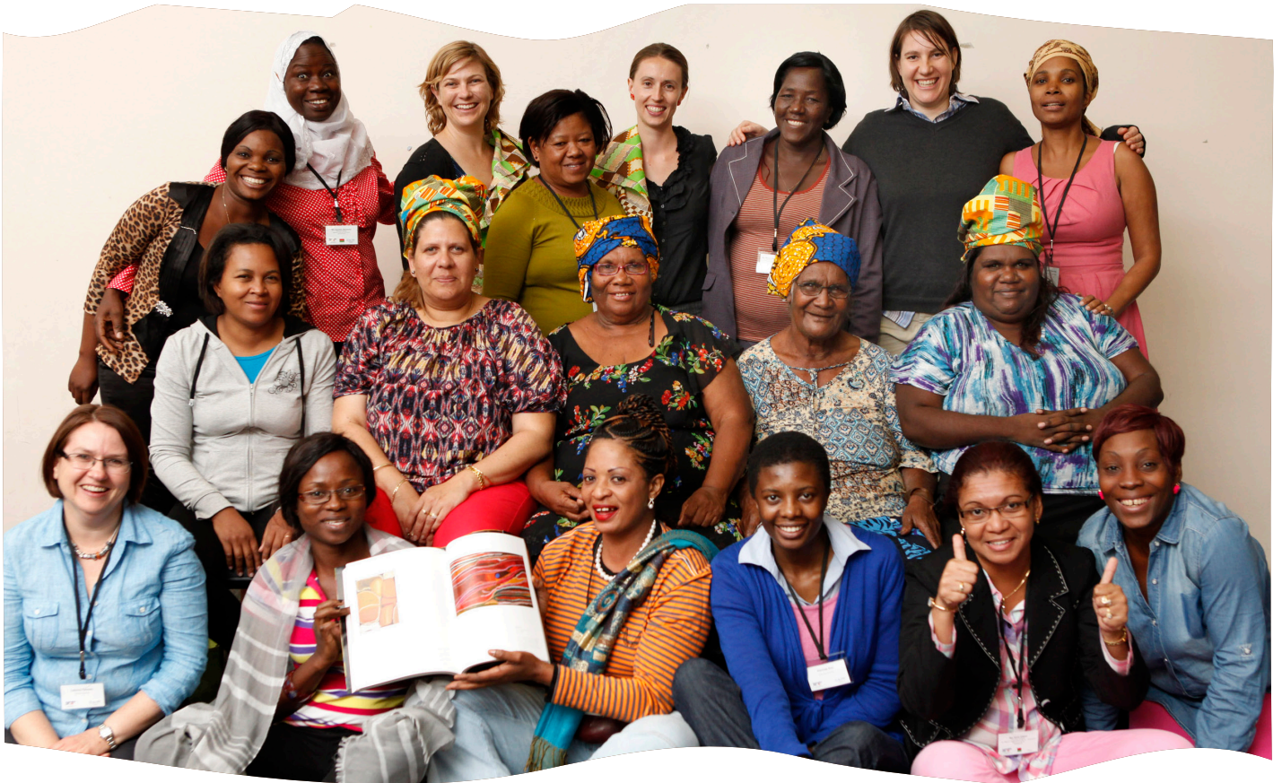
Pilbara Traditional Owners and African Women in Mining delegation

In November 2012, senior women from Yamatji Marlpa Aboriginal Corporation met with a visiting delegation of women involved in mining and development issues from various nations across Africa.