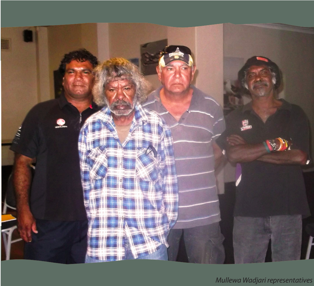
Mullewa Wadjari representatives

As a result of meetings held in June, July and December 2012, there is now an ASA Working Group made up of representative from all of the ASA groups. All five Native Title Groups have endorsed a Memorandum of Understanding that sets out the relationship of the five groups in negotiations with the State. Representatives from each of the groups have expressed a firm commitment to participate in joint discussions with the State in order to work toward an agreement over the ASA area.