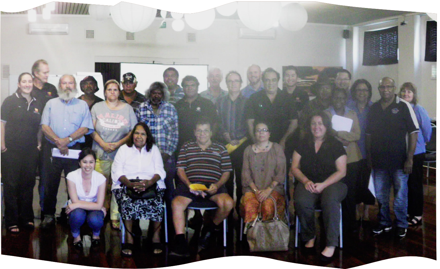
Participants at the December 2012 ASA Working Group Meeting

YMAC congratulates the Amangu, Hutt River, Mullewa Wadjari, Naaguja and Widi Mob people on coming together to work towards common goals, and on the positive outcomes reached in the spirit of cooperation in 2012.