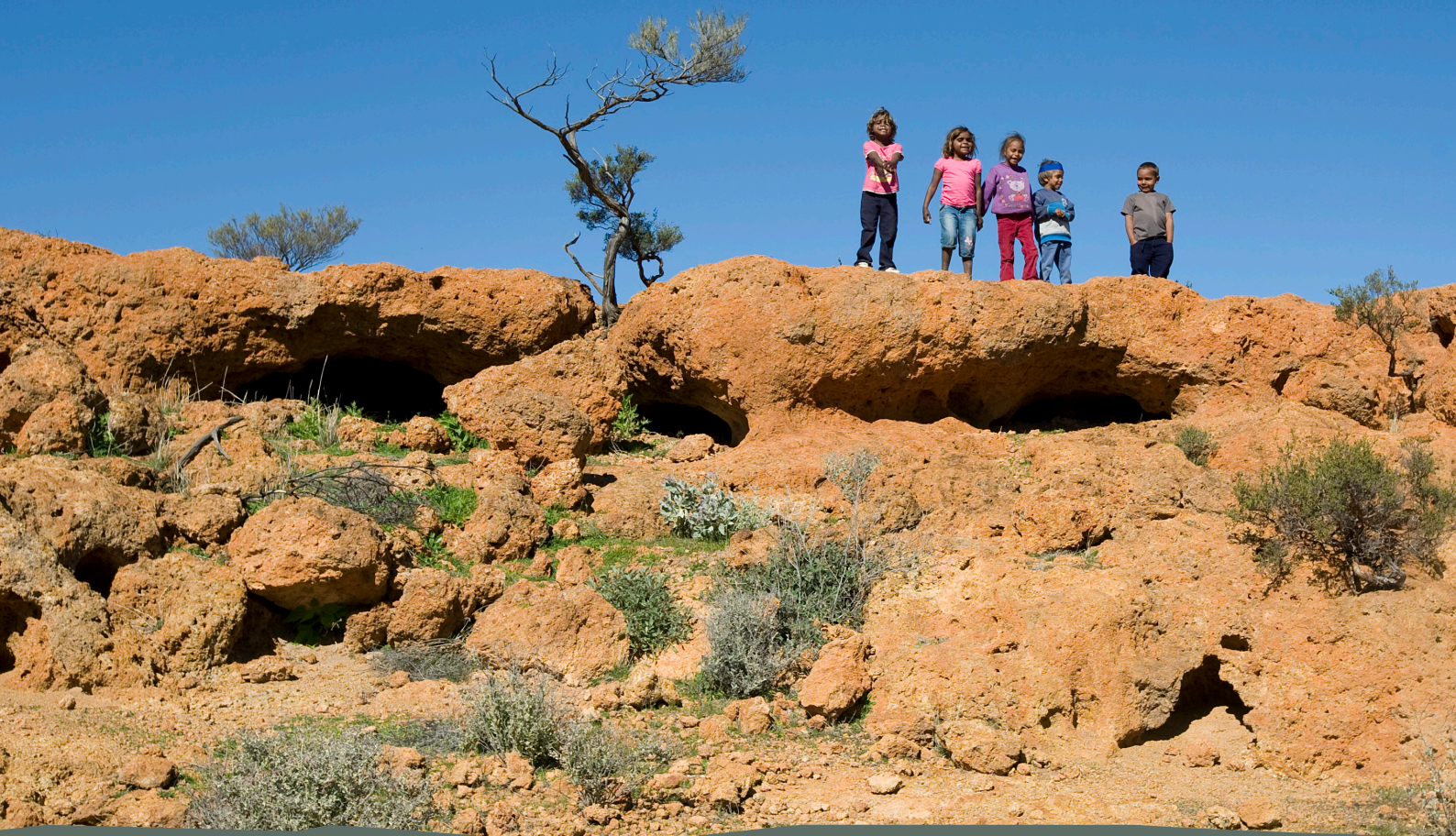
Badimia children on country