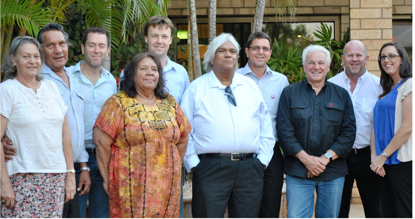
K&M community members with YMAC and IOH staff

In November 2012 the Kurama and Marthudunera (K&M) native title group announced the signing of an agreement with Iron Ore Holdings Ltd (IOH) over their Buckland Project in the Pilbara region of Western Australia.