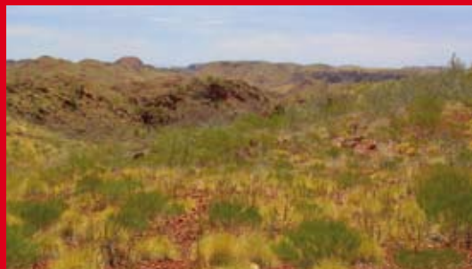
Njamal country, between Marble Bar Road and Great Northern Highway, 100 km's south of Port Hedland.

In September 2007, Njamal Traditional Owners commenced a mining agreement with Moly Mines Limited. The agreement combines cultural and environmental protections, plus education and training opportunities.