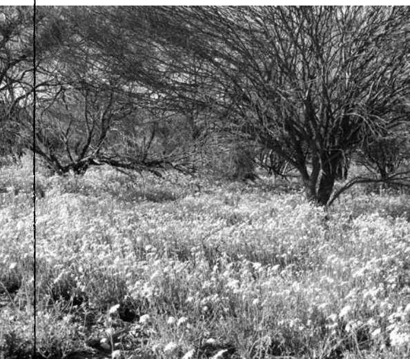
Yamatji wildflowers in bloom

YMBBMAC actively pursues value for money for the provision of all its services and always seeks to obtain at least three quotes. Many corporate services are outsourced, enabling YMBBMAC to reduce risk and to access specialist services. In the 2007/08 reporting period YMBBMAC engaged 21 consultants to undertake consultancy work at a cost of $3,962,340.00. Consultants are used when there is a requirement for specialised services which cannot be met by YMBBMAC staff due to insufficient in-house resources, or where independent advice is required.