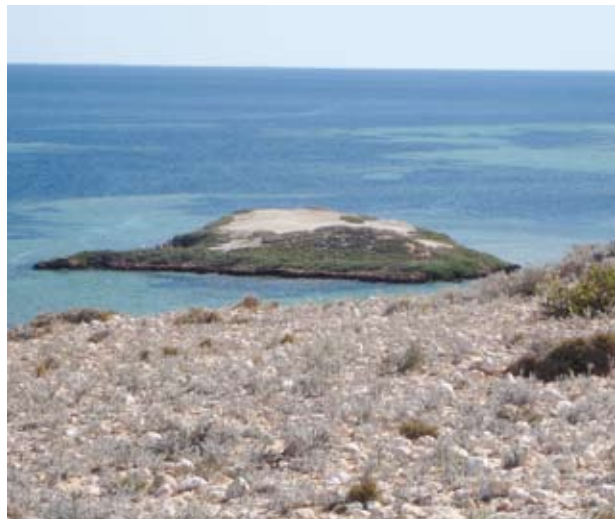
Near Shark Bay, Malgana country

We also adhere to Australian Accounting Standards, with the two senior finance personnel suitably qualified with continuing professional development obligations. YMBBMAC acknowledges that its funding levels have increased in recent years to counter the significant increase in input costs and to be able to meet the demands of progressing native title outcomes. However, in view of the continuing high level of activity, the organisation continues to wrestle to maintain or reduce cost levels in regions where the CPI is well above the Australian average. Facilities and services such as accommodation, housing and travel have become more difficult to procure at a reasonable cost.