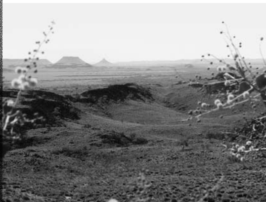
Millstream - Chichester National Park, Ngalmura Injibandi country